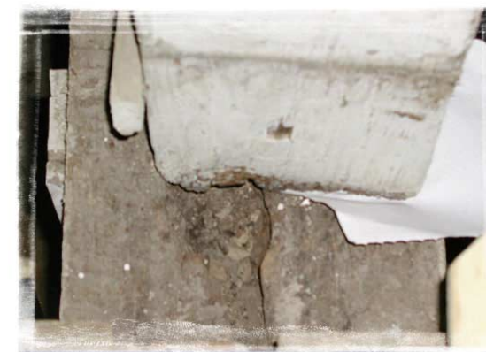
Close up showing rot in a beam and column at the Mill.

Following up on Kate Maynor’s suggestion, we are planning a “Community Day” at the mill on Saturday, May 5. We are focusing on people living in the neighborhood, especially apartment houses along