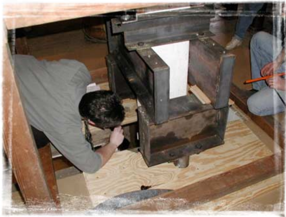
Adjustments being made to the lift assembly prior to lifting the upper floors.

the upper floors of the mill. The jack rests on timbers in the basement and lifts a steel and timber assembly which reaches up to the main beam supporting the second floor, attic and roof, a weight of about 17 tons. The great event took place in March, and while it was pretty modest as lifts go—about 1/8 inch—it was enough to expose the rotted area in the main basement beam and the bottom of the column which rest on it. Procedures are now being developed by Steve and Kirk Mettam (our structural engineer) to stabilize the situation, probably with the use of epoxy, and at the same time find a way to deal with a sizable crack which runs most of the length of the beam. The two accompanying photographs give an idea of how the whole lift assembly looks. You'll find additional photos on our web site, and they will be added to as the work proceeds.