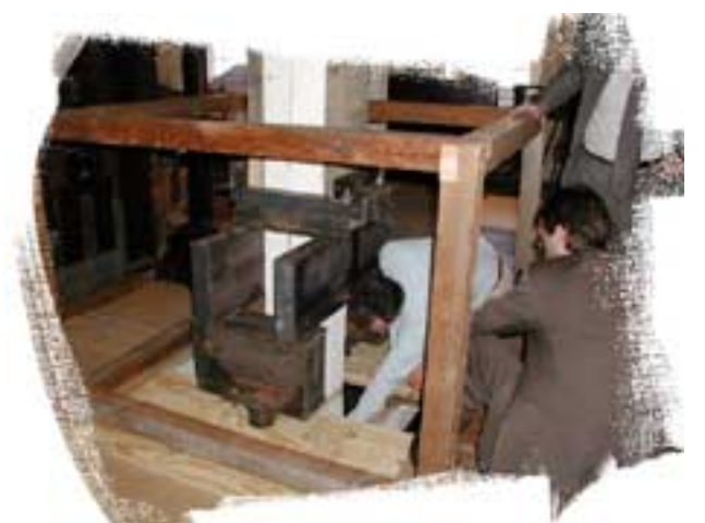
Steel and timber shoring in place around the column.