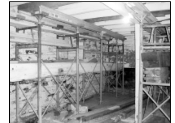
Scaffolding erected in basement to support the millstone load on the main floor.