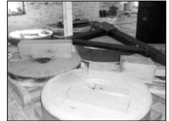
Millstones stored at south end of main floor.

personnel to work with Steve Ortado to cut the wheel in pieces and remove them using a crane. We will be sure to photograph the event and file a report about it in the next issue of Milling About .