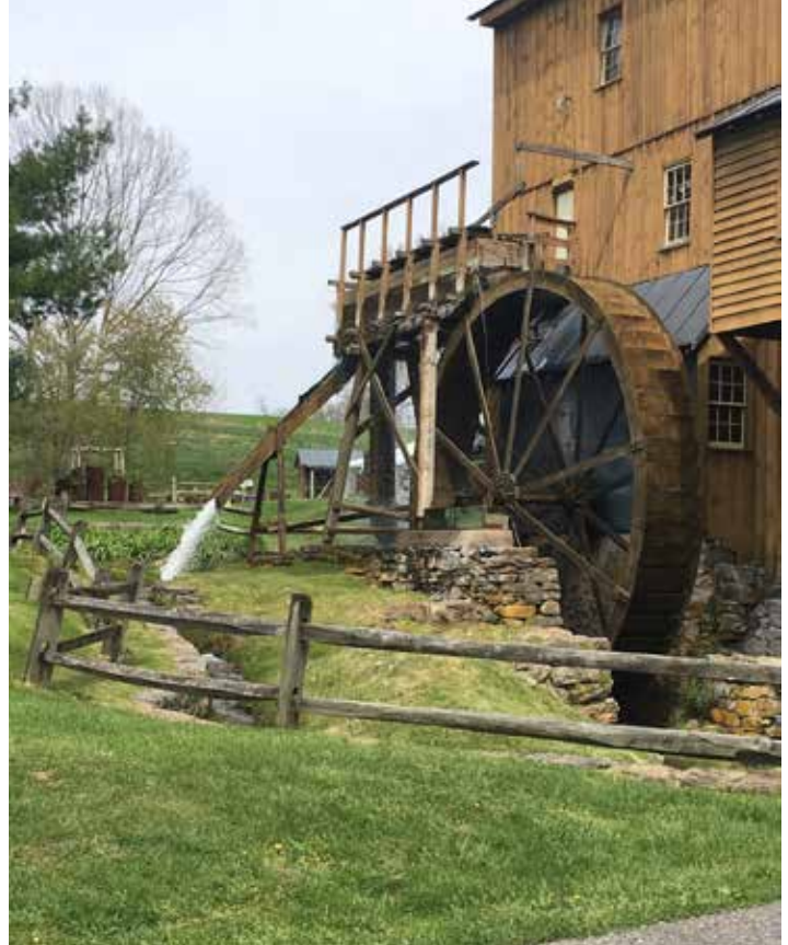
Wade's Mill, near Lexington, Virginia, was built in 1750. It is the state's oldest continuously operating mill.