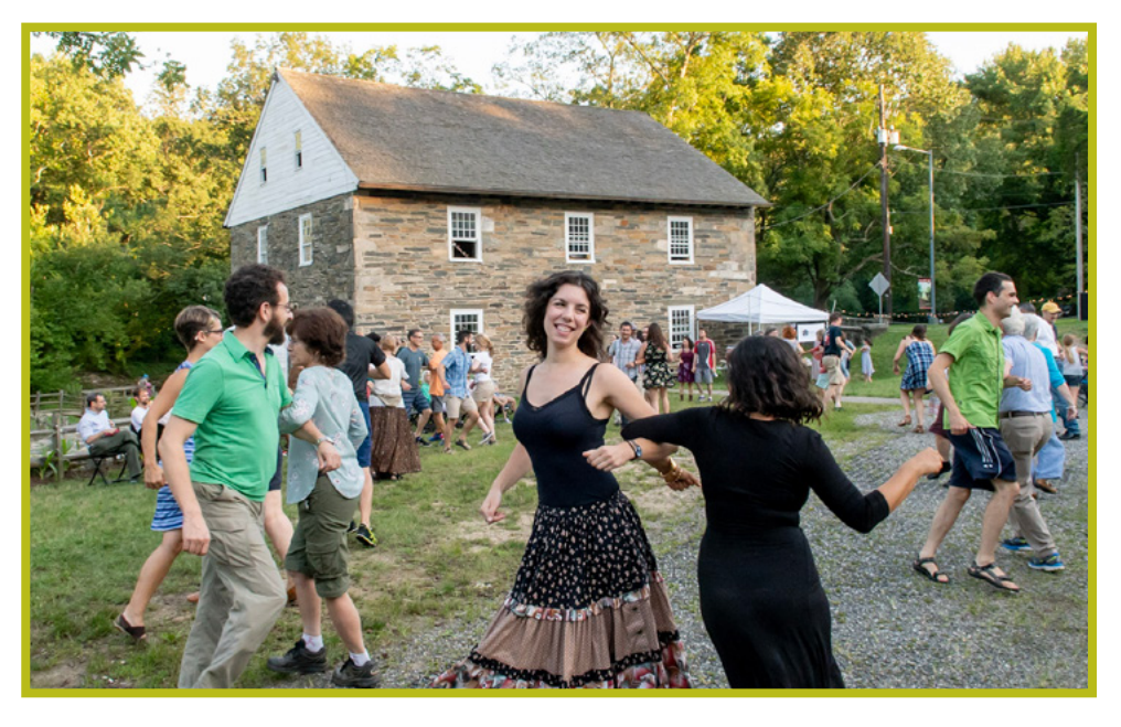
Free public programs at Peirce Mill are supported by the DC Commission on the Arts and Humanities

The DC Square Dance collective returns to Peirce Mill with a live music program under twinkling lights in the mill yard. A caller will teach all the dances; no prior experience necessary.